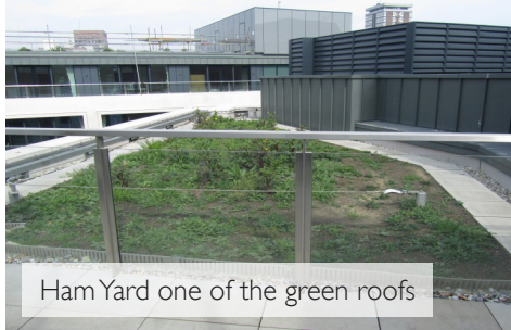
Ham Yard one of the green roofs

Transport: Ham yard is located in central London, within walking distance from public transport stations - the hotel staff and guests can use the sustainable transport solutions, i.e. tubes and buses very easily - if you need any information on the available public transportation around the site, please contact the reception. The hotel also has cycle storage and cyclist facilities for the staff who cycle to work on daily basis.