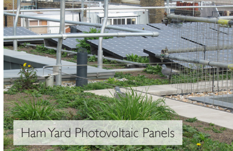
Ham Yard Photovoltaic Panels

Reduction of Construction impact on Environment: During the construction of the Ham Yard Hotel the contractor took great steps to ensure that waste was kept to minimum. To this end, all waste was monitored and recorded from site with 100% of all waste being recycled off site.